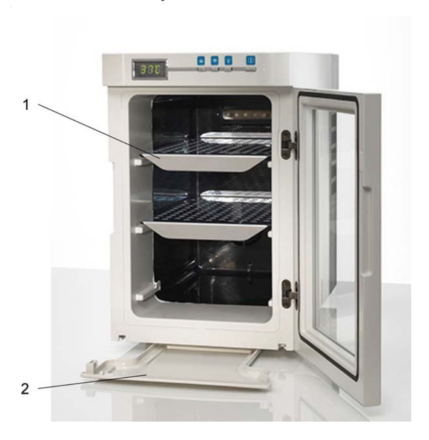
Figure 4-3: Cooling or heating elements and the condensation tray in the Heratherm Incubators IMC 18

A removable tray [Fig. 4-3; 2] is provided underneath the device which collects the condensation which occurs whilst the useable space is in use.