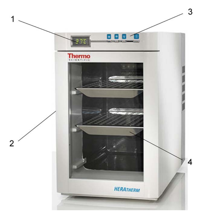
Figure 4-1: Front view Heratherm Incubator IMC 18