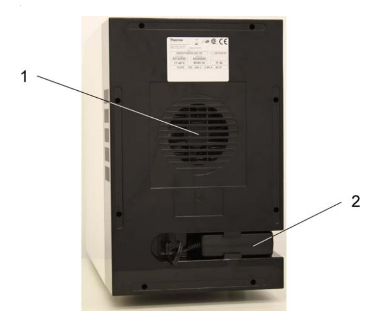
Figure 4-2: Rear view Heratherm Incubator IMC 18